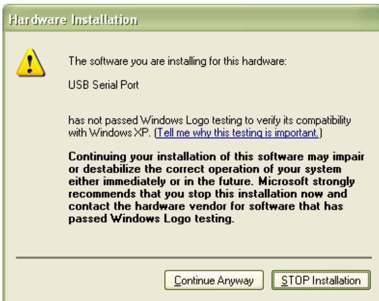
Figure 1.1 Logo Test Warning Pop-Up Window

Once an INF file has been edited, its original digital signature is no longer valid. Any attempt to load a driver package that includes a modified INF file as a clean install will result in a warning window (fig. 1.1) to appear.